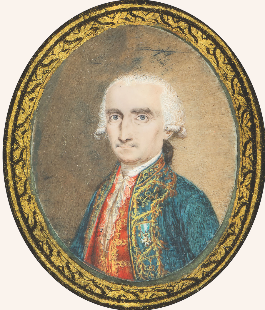
Diego de Gardoqui, unknown artist, ca. 1785

His Excell y Don diego de Gardoqui. — Sir, The day before yesterday gave me the honor of your Excellency's favor, written on the 12 th of June, with a postscript thereto of the 22 d of July. It was accompanied by the cloth made of the wool of the Vicuna, which indeed is of a softness & richness which I have never seen before, & is truly worthy of being called his Majesty's true manufactured cloth. For your Excellency's goodness in presenting me with this specimen of it, I pray you to accept my best acknowledgements. I receive it Sir, as a mark of your polite attention to me, & shall wear it with much pleasure as a memento thereof. The color is really beautiful, & being natural can never fade. — I feel myself much indebted to your Excell y for communicating the testimonies of my gratitude to the King, thro' the medium of His Excell y Count de Florida Blanca, for his royal present of the Jack asses; one of which arrived very safe, & promises to be a most valuable animal. I am endeavouring to provide a female, that the advantages which are to be derived from this Jack may not end with his life. I can omit no occasion of assuring your Excellency of the high sense I entertain of the many marks of polite attention I have received from you; nor of the pleasure I should feel in the honor of expressing it at this seat of my retirement from public life, if you should ever feel an inclination to make an excursion into the middle States. I have the honor to be &c. G: Washington