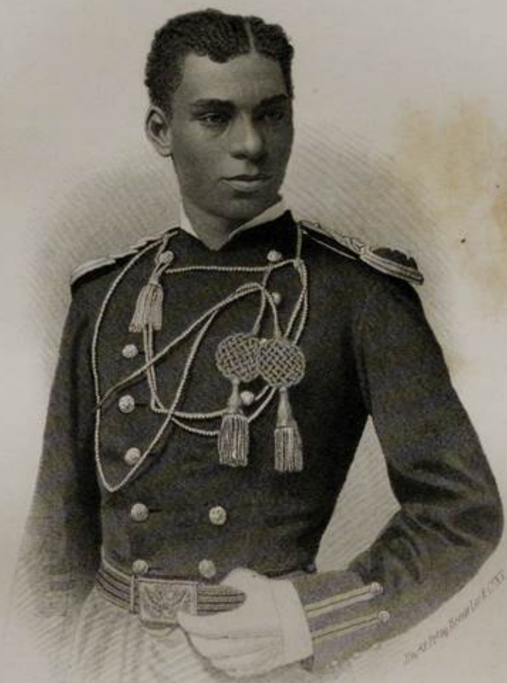
Henry O. Flipper 2d Lieut 10 th Cavry.