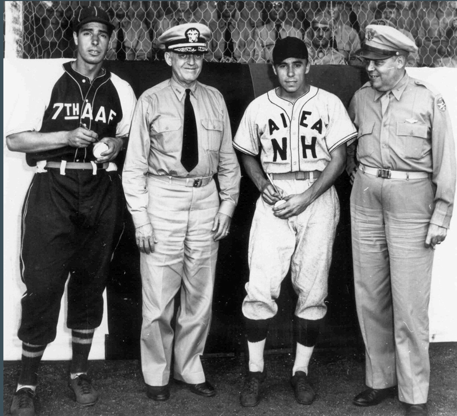
Army Air Force Sergeant Joe DiMaggio and Navy Chief Specialist Harold "Pee Wee" Reese with commanding officers, July 7, 1944.