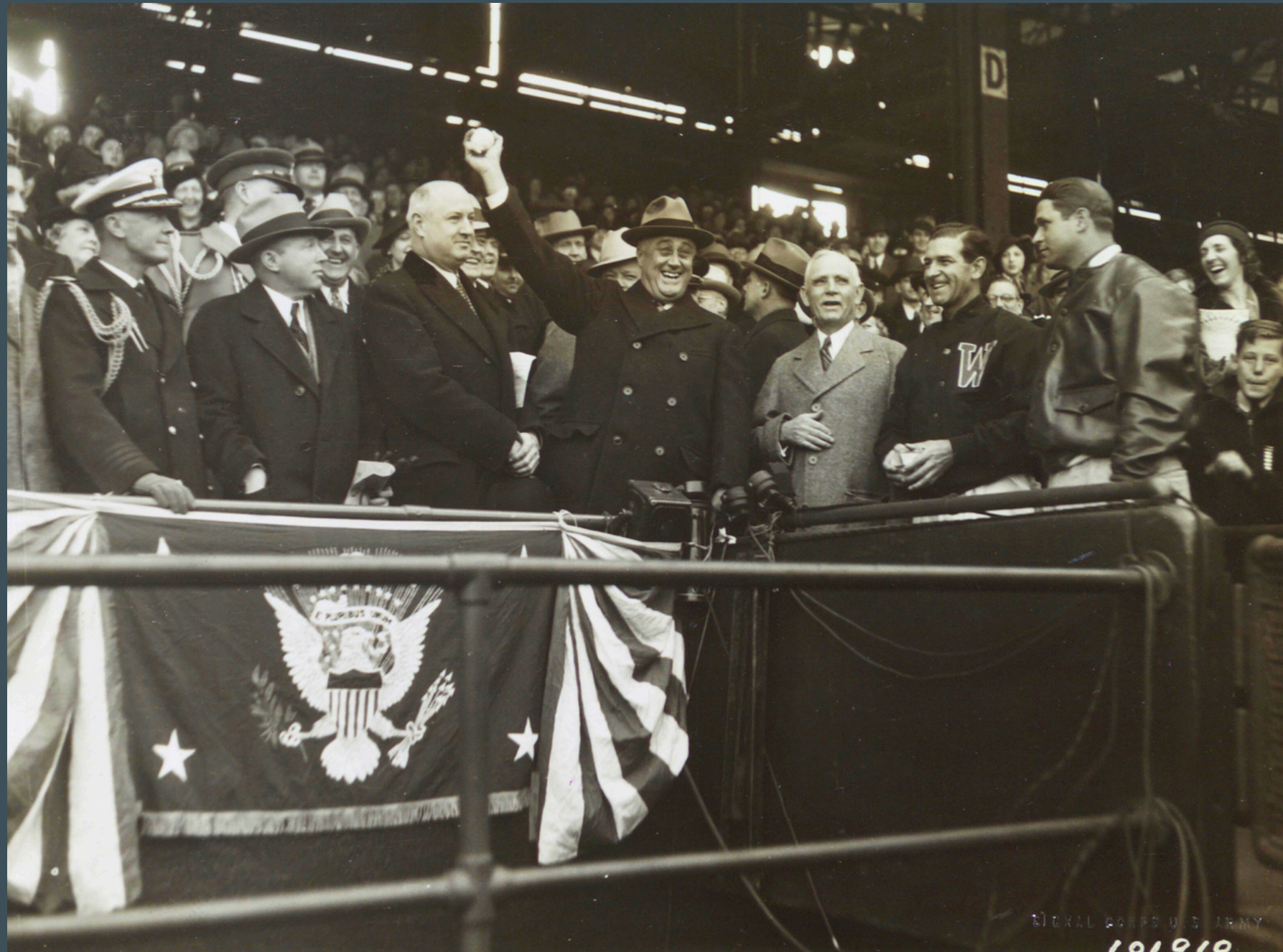
FDR tossing the first ball at the official opening of the baseball season, April 17, 1935.