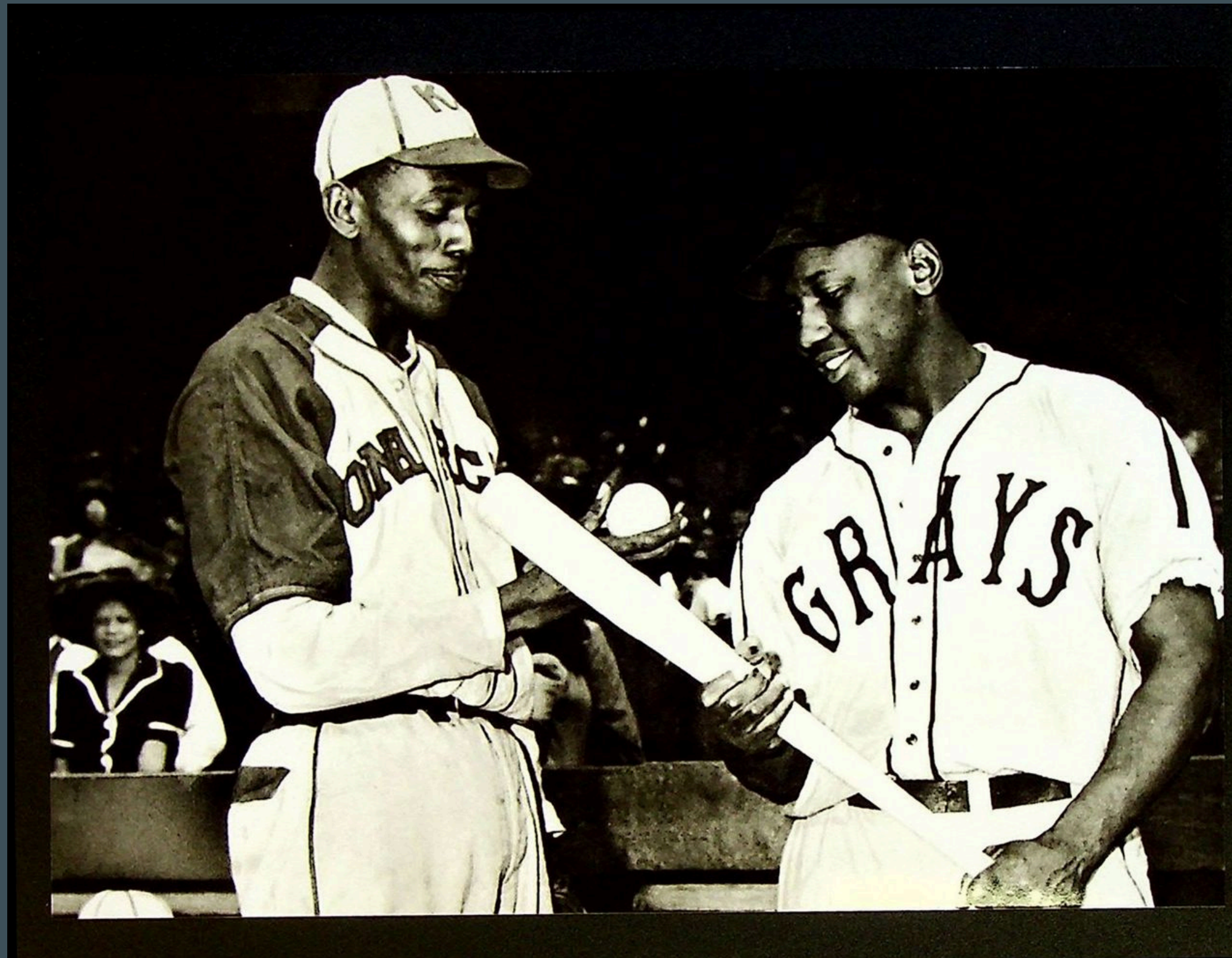
Satchel Paige and Josh Gibson at the 1942 Negro League World Series, 1942.