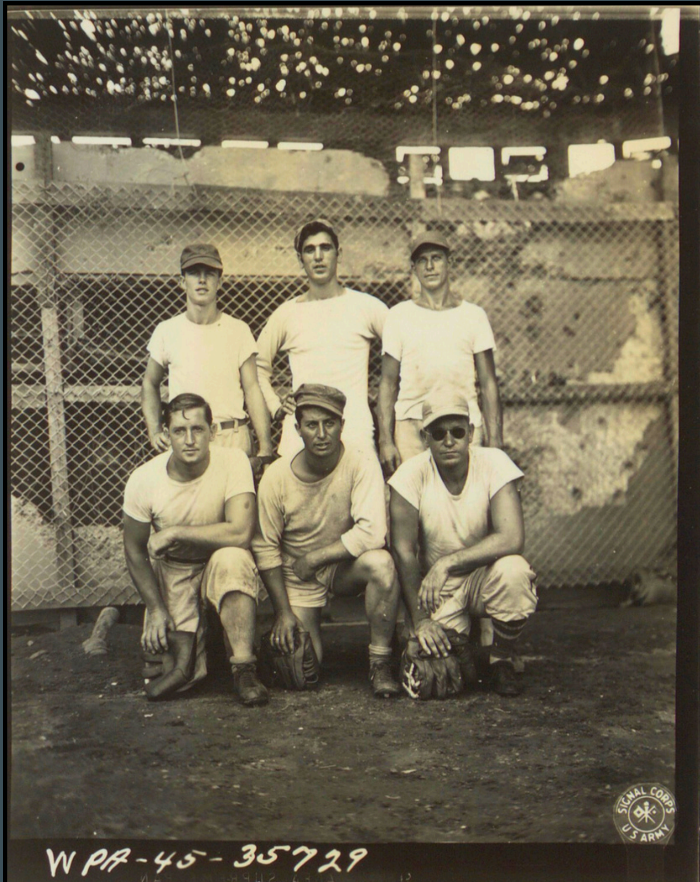
Members of the Army All-Stars baseball team, October 23, 1945.