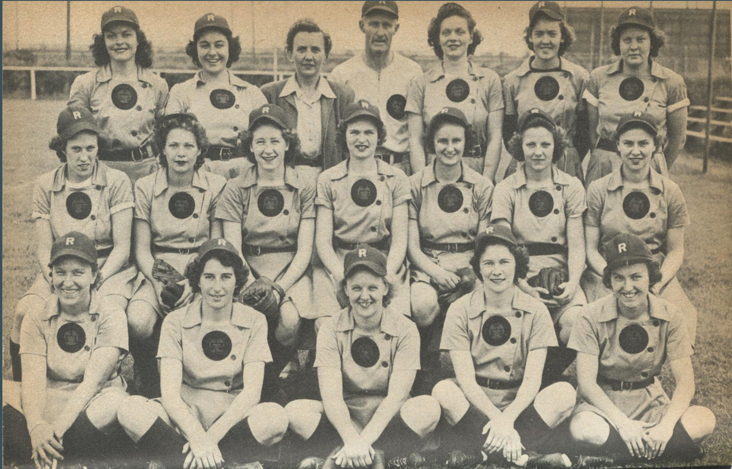
The Rockford Peaches, All American Girls Professional Baseball League champions, 1945.