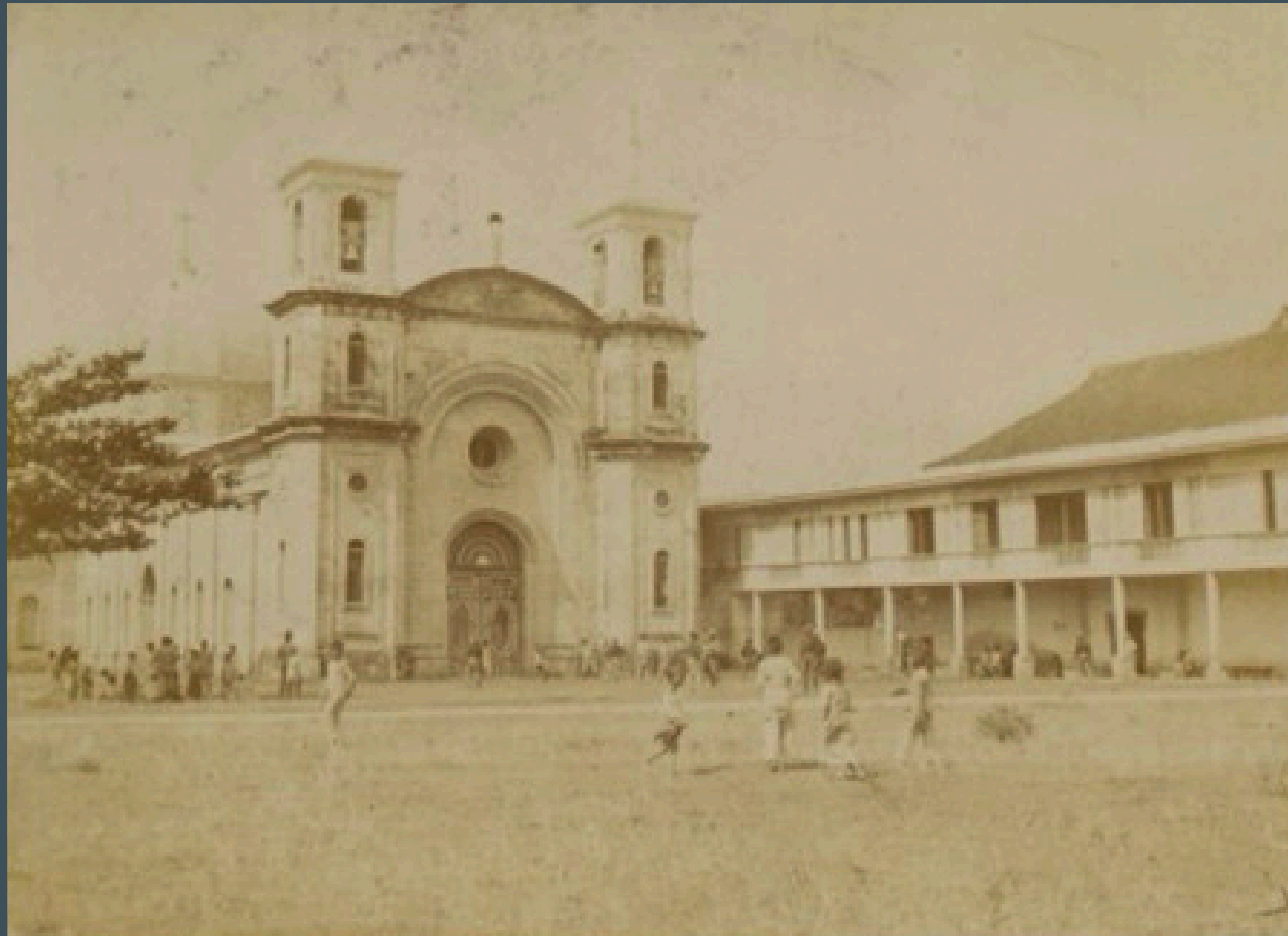
Soldiers playing baseball by the Church of San Simon, Pampanga, Philippines, ca. 1942–1945.