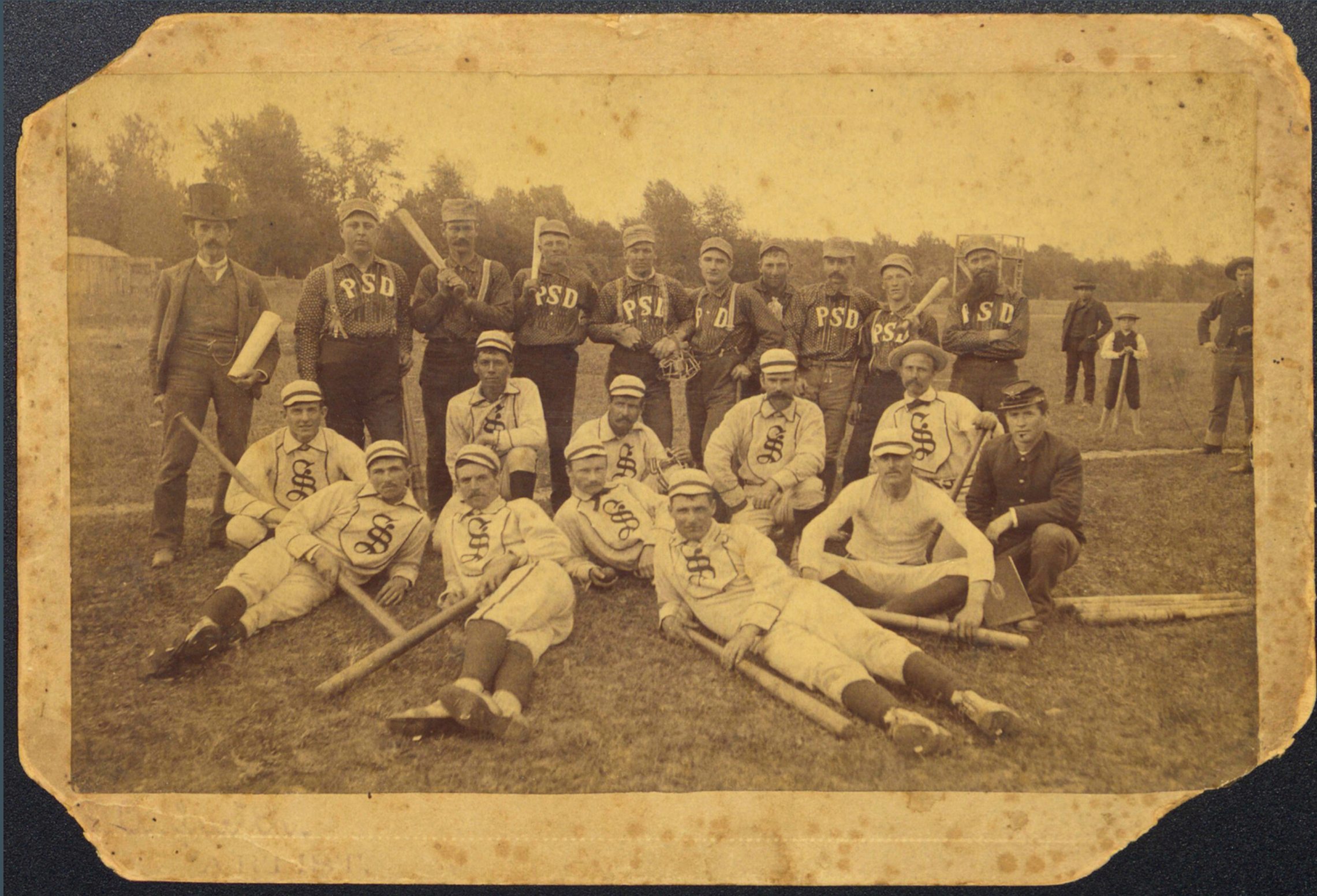
19th-century soldiers' baseball team, n.d.