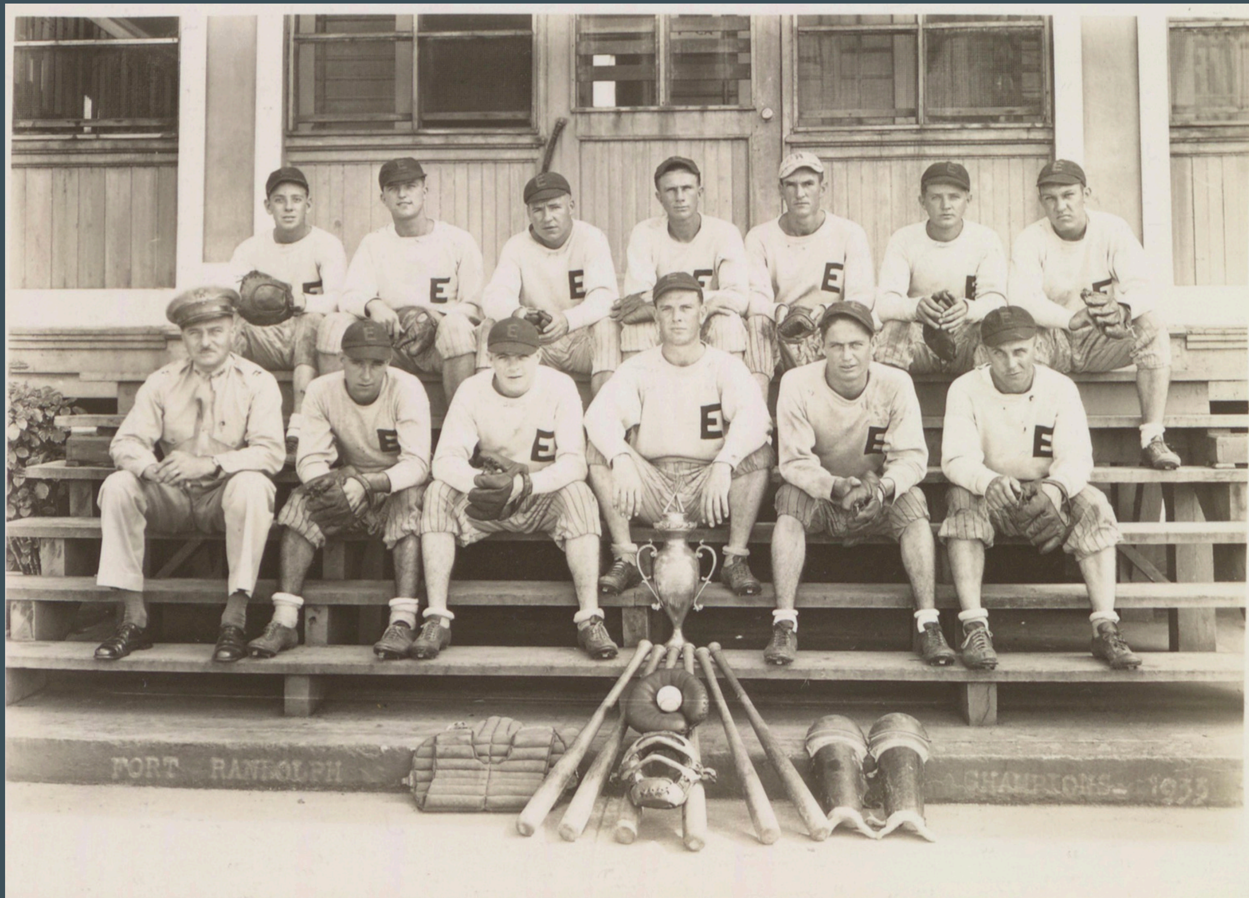
A baseball team in the Air Corps at Fort Randolph, TX, ca. 1942–1945.