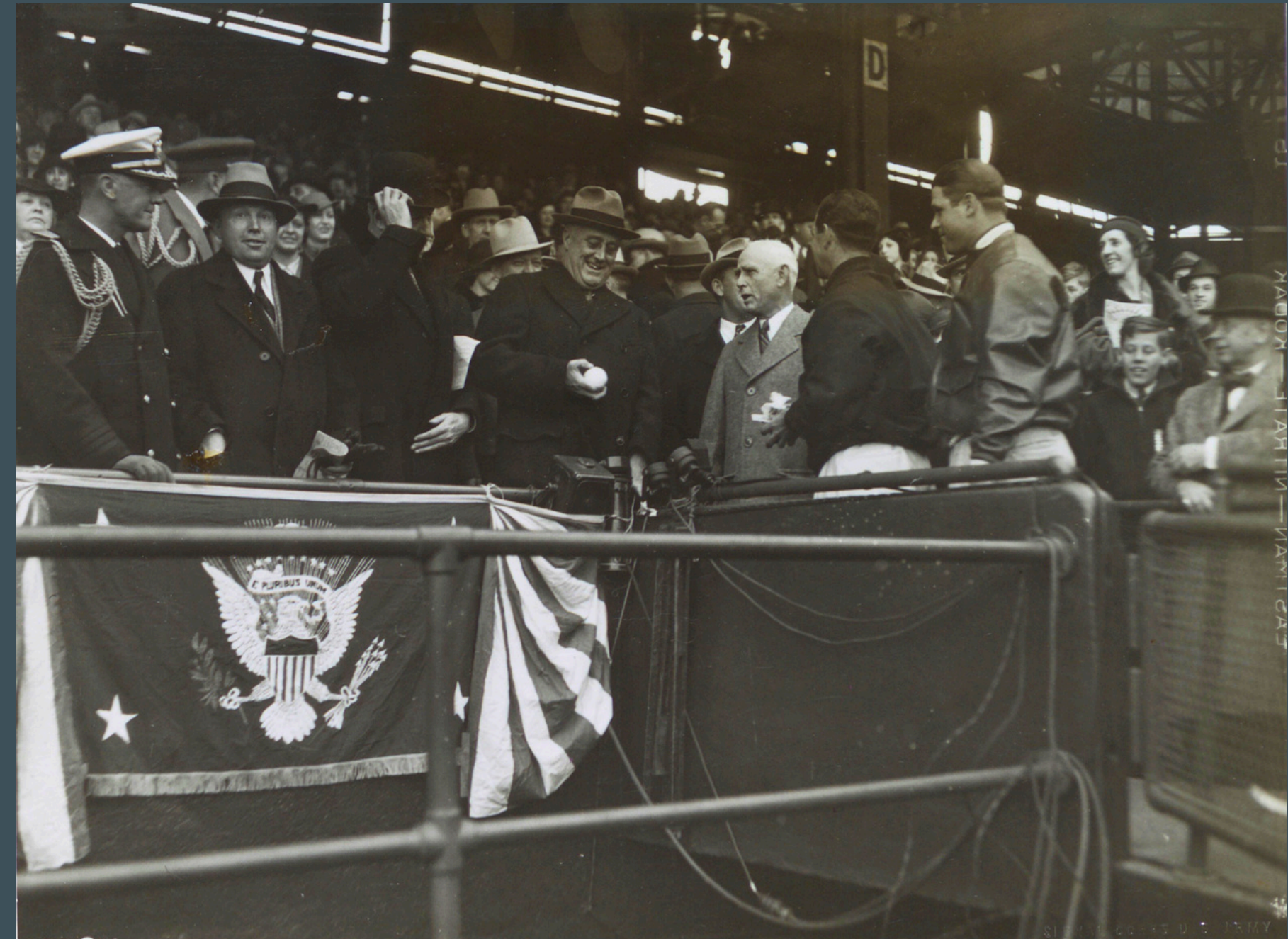
FDR receiving the baseball at the official opening of the baseball season, April 17, 1935.