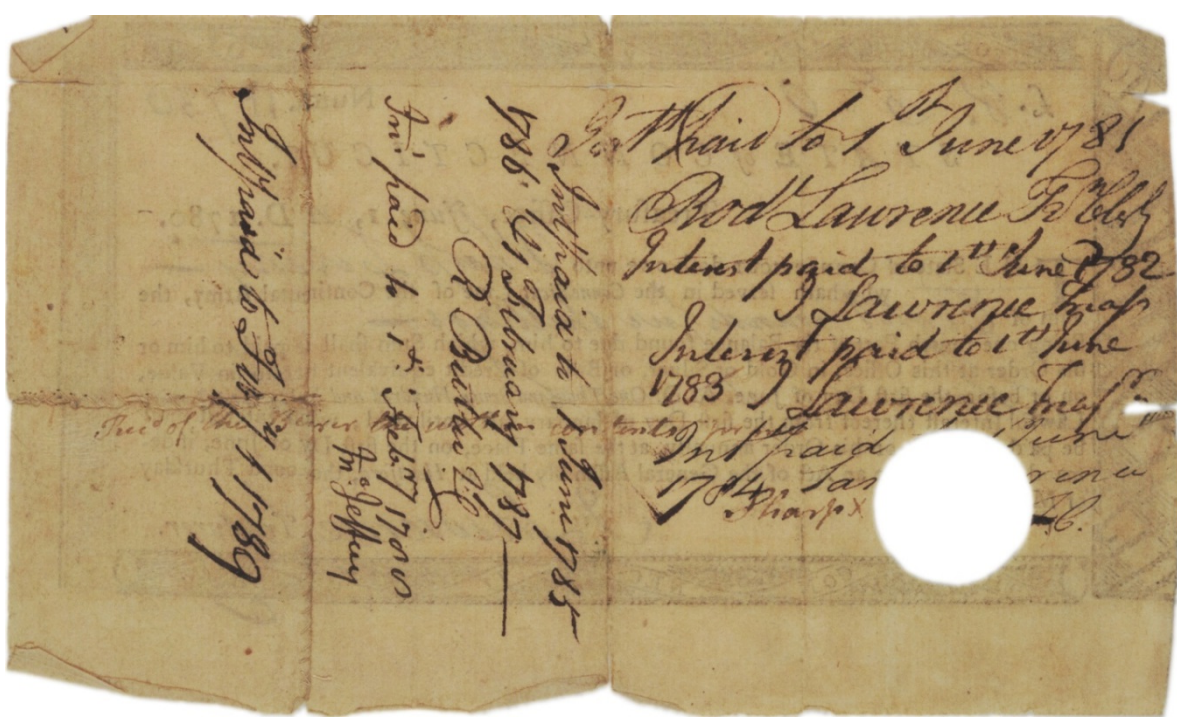
Pay warrant to Sharp Liberty, 1 June 1780–1789 (Gilder Lehrman Institute, GLC09132.01)