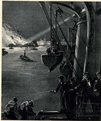
OFFICERS AND MEN OF THE SPANISH FLAG-SHIP HASTENING TO THE RESCUE—(Drawn in Accordance with Havana Despatches.)