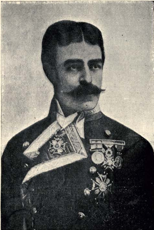
REAR-ADMIRAL SEGISMUNDO BERMEJO Y MERELO, Spanish Minister of Marine.

In the mean time, although, as we have said, some of the Jingo's and the sensational newspapers have done their best to promote ill feeling by spreading abroad