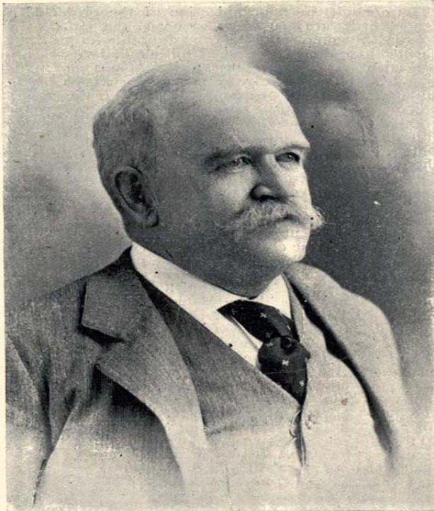
HON. JOHN D. LONG, Secretary of the United States Navy.

This explosion occurred about 9.45 on the evening of Tuesday, February 15. The night was intensely dark; the Maine was anchored about five hundred yards from the arsenal, and two hundred yards from the floating dock. The American Ward Line steamer City of Washington was about two hundred yards away, and a little farther off still was the Spanish cruiser Alfonso XII . Captain Sigsbee, who