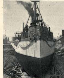
"MAINE" IN DRY DOCK NO. 2, NEW YORK NAVY-YARD—BOW VIEW.