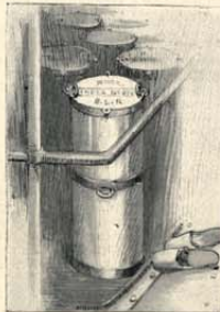
IN THE MAGAZINE. Each tightly sealed Copper Tank contains a Half-Charge.