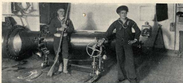
THE "MAINE'S" FORWARD TORPEDO-TUBE.

LOSS OF THE UNITED STATES BATTLE-SHIP "MAINE" IN HAVANA HARBOR, FEBRUARY 15, 1898.