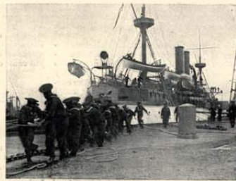
"MAINE" LEAVING THE NEW YORK NAVY-YARD FOR THE SOUTH—HAULING ASHORE THE MOORING-CHAINS.