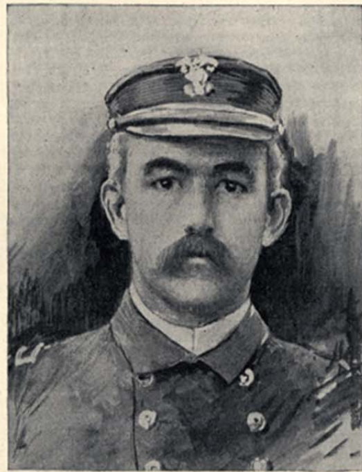
LIEUTENANT FRIEND W. JENKINS, U.S.N. Killed in the Explosion on U.S.S. "Maine."

The theory entertained by the Secretary of the Navy is that the disaster was the result of pure accident. Even if a torpedo had blown a hole into the ship and exploded the magazine, the direction of the explosion might not be ascertainable, for, in the judgment of experts, the explosion inside would be quite likely to widen the hole through which the missile entered and reverse all the signs. Little hope is entertained, therefore, of obtaining positive proof as to the source of the disaster. As one old sea-dog expressed it, the historians of the civil war are still quarrelling as to whether the